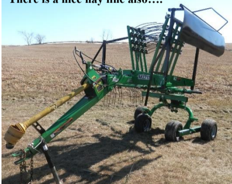
Frontier RR2211 Rotary Rake , walking tandems, on frame storing teeth, purchased new & sure wasn't out of the shed much.