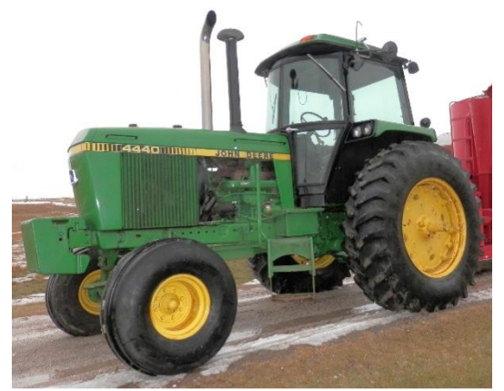
JD 4440 Later Mdl, SGB, PS, Triple remotes, Gen. step, 540/1000 shafts, 20.8R-38's (60%), Duals, 4-rib fronts, chrome stack, 10 suitcase weights—A sweet ride!