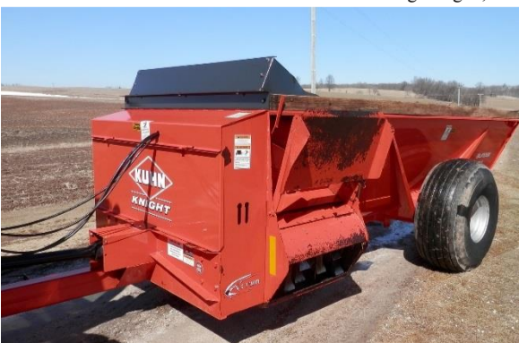
Kuhn Knight 8114 Pro Twin Slinger Spreaders , single axle, 16.5x16.1 floaters, purchased new—limited use & super paint.