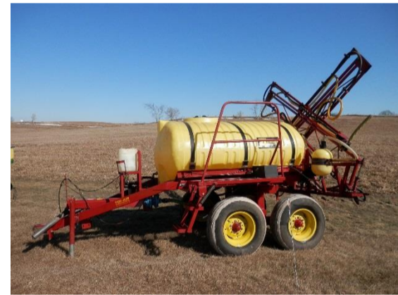
Top Air Field Sprayer , 500 gal. 36' boom, foam markers, Raven controls, tandem axle, 540 pto drive pump—clean. Coming— CIH 5100 drill . Nice!

JD 2800 4X Vari Plow , Gauge Wheel—always shedded, limited use for years & very sharp. 200 bu gravity box on an older JD bolstered 6-bolt gear. Sells w/like new Unverferth 14' Dry fert. auger. JD 12' Disk; Brillion P-10 14' Cultipacker like new scrapers, bright paint, big rolls and little signs of use. Brillion 9-shank disk chisel w/independent disk control & 5-bar spike drag.; Mac Farland 4 sec. all steel hyd. lift cart drag—shedded & Exc.