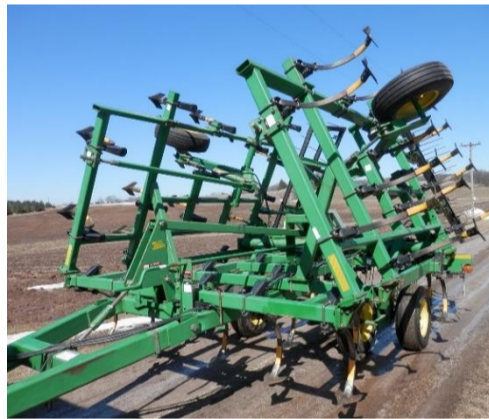
JD 980 24' Field Cultivator , new or like new 9" sweeps, walking tandems base w/single wheels on wings, Fore-aft leveler, 3 bar coil tine harrow