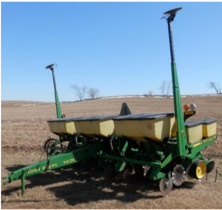
JD 7200 Max Emerge 2, 6RN Planter fluted coulters, HD springs, Dry fert., Comp-U-Trac 150 Monitor, limited acres planted & after use is cleaned up, fert. augers painted & shedded.