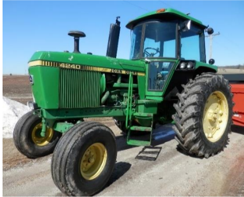
JD 4240 SGB, QR, DR, 18.4R-38's (90%), clean & original.

Also— JD 2440 w/Dunham Lehr Ldr., Excellent!