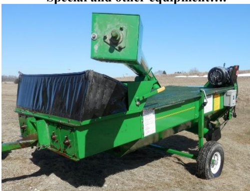
Rare Auction Offering & Portable Kwik Kleen small grain cleaner , sells w/2 sets of 5 screens, fold up discharge auger & 5 hp. drive motor—purchased new.

Also-- Miller Pro 1060 forage blower—nice