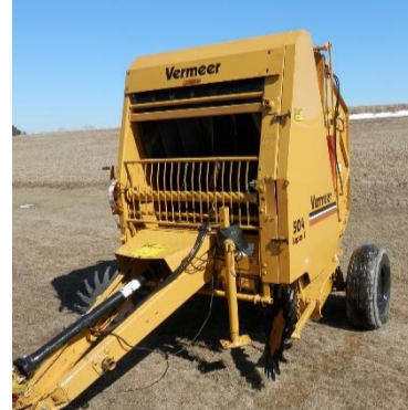
Vermeer 504 Super I Rd. Baler , Merge Wheels, Twine & nice paint!