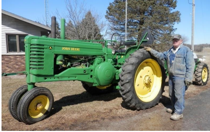
JD A, born & raised on the Maeuser Farm. A 1957 baby and older restore. She sells w/13.6-38's, 540 pto, Roll-O-Matic front and still runs & drives great! Selling alongside & after JD No. 8 7' sickle mower to fit JD A