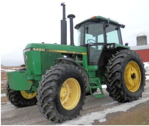
JD 4450 MFWD, SGB, PS, DR, 20.8R-38's (90%), duals, w/3-sets of rear weights, 16.9R-26 (80%) w/fenders, a rare find with only 3927 original hours!

A complete farm line-up that speaks for itself— Bid live in-person or Simulcast online with Bidspotter.com for most of equipment selling.