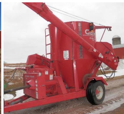
Gehl 170 Mix All portable grinder/mixer w/Gehl 2100 Scale, long folding auger, hyd. drive intake & discharge. Purchased new - nice!

And ....3 pt. 7' Scarifier box blade w/bolt on edge. From the Grain Operation.... '92 Kodiak tandem axle grain body truck, 18' steel box w/hoist, roll tarp, Cat powered—well maintained. 6 Grain Bins 1800 to 5000 bu. , all w/dryer floors, 2 shared sweep augers, available by June 1 st or earlier. More Misc....Winpower gen.; Tebben 3 pt. 4R corn cult. , Danish tine, dual Stabilizers & Gauge wheels; 3 pt. mount Crop Cure Dry Hay Preservative applicator ; assortment of lumber, planks, boards—lots of hard wood; hyd. cylinder; steel T-post for plots; Hyd. cylinders; 8x12 4 stall building on skids, 3 sided wood construction w/steel roof, no floor, stall have hay feeders. Storage building, 6x8 w/wood floor & steel sided —many uses. Cement mixer on skid w/motor; Calf Box for Truck box; Tractor tire chains —flat style; 300 gal. poly storage tank & sprayer tank ; 1/2 rd. 150 gal. fuel tank w/hand pump; JD paint theme 2 1/2 x 4 1/2 yard trailer; Homelite portable generator ; transfer pump w/B&S gas power; Smidle 5x7 Steer Stuffer —good; Wagon or bin style tube dryer.