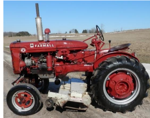
2 Lone Reds in the Shed.... IH Farmall Super A selling w/belly mt. mower deck—purchased locally at Hingiss Implement.