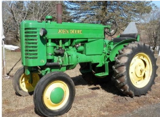
JD M, 11.2-24's(90%), rear pulley, 540 pto, 2-pt. lift; runs & drives great. SN 31497 Selling alongside and after, JD 1X plow.

Also— JD 2440 w/Dunham Lehr Ldr., Excellent!