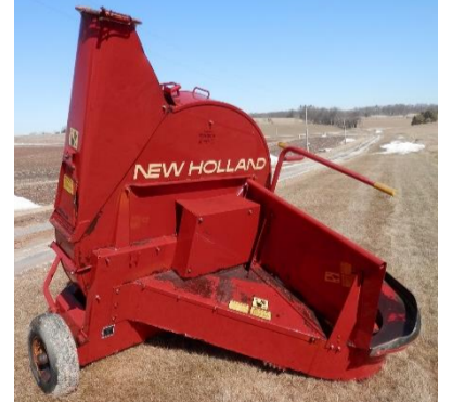
Ford NH 28 Forage Blower , good tight spinner, really great for age.

Also-- Miller Pro 1060 forage blower—nice