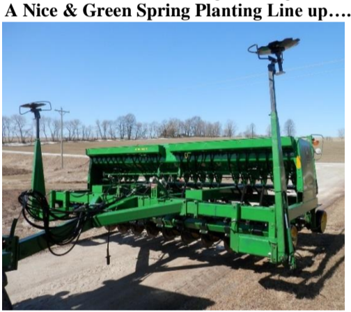
JD 750 NT Drill w/newer 2-pt. swivel quick hitch, front grass & markers, HD rear hitch & hyd. coupler, lights & bright paint.

Check out millenco.com for more tractors & Carl's JD 9500 combine.... JD 40-U Industrial Utility Tractor w/belly mt. sickle mower. SN 64343 A late model '55—ready for summer pastures, fencelines, & ditches. Ford 4023C , Ford Industrial version of Ford 3600, Gas, ROPS, 13.6-28's like new, foot throttle, DL, SR, 3-pt., 540 pto, nice tin, solid fenders, big lunch box & front bumper, 4952 hours on the meter. JD 9500 Combine, RWA, bin extensions, stalk shredder, 17' auger, 3300 separator hrs., has been a good machine for Carl. JD 918 18' Flex Head, Poly skids & fingers, sells on a homemade head hauler. JD 444 4R CH on a gear carrier.