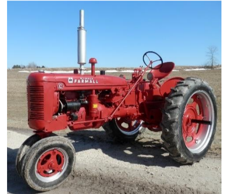
Farmall C Cultivision, 11.2-36 FS, rear pulley, very straight & sharp w/more recent paint.

Check out millenco.com for more tractors & Carl's JD 9500 combine.... JD 40-U Industrial Utility Tractor w/belly mt. sickle mower. SN 64343 A late model '55—ready for summer pastures, fencelines, & ditches. Ford 4023C , Ford Industrial version of Ford 3600, Gas, ROPS, 13.6-28's like new, foot throttle, DL, SR, 3-pt., 540 pto, nice tin, solid fenders, big lunch box & front bumper, 4952 hours on the meter. JD 9500 Combine, RWA, bin extensions, stalk shredder, 17' auger, 3300 separator hrs., has been a good machine for Carl. JD 918 18' Flex Head, Poly skids & fingers, sells on a homemade head hauler. JD 444 4R CH on a gear carrier.