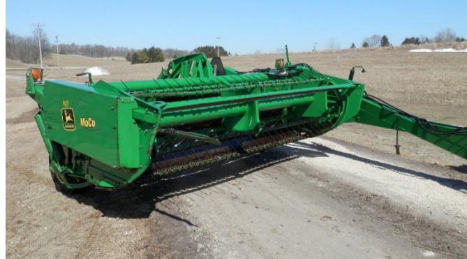
JD 720 9' Mo Co Sickle haybine , 9' rubber rolls, bolted sections, lights.